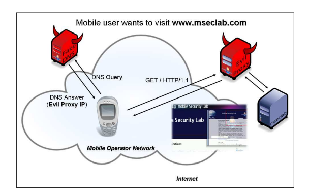
Figure 2: HTTP traffic redirection example

mod_rewrite [13]Apache module, that allows for rewriting the victim request in order to be correctly forwarded. The interception of the data connection can finally be achieved using the Audit feature of the ModSecurity apache module [14], able to log all of HTTP requests and responses forwarded by the proxy. The figure 2 shows the attack scenario described.