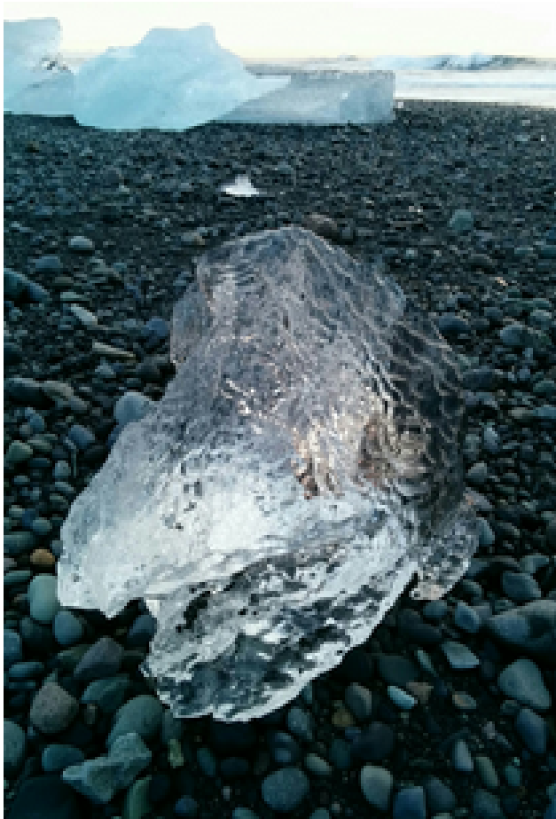
One of several input photos